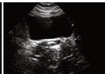
Abdominal Probe Bladder

Interson Corporation, located in Silicon Valley, has been a leading manufacturer of ultrasound imaging probes since 1989. Interson products are designed, manufactured, and distributed in full accordance with the requirements of FDA's Quality System Regulations and other U.S. and international quality system standards.