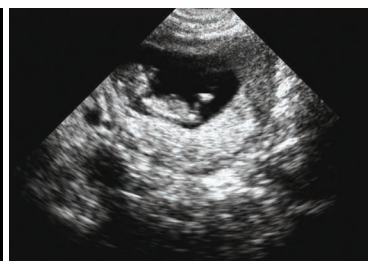
Abdominal Probe 1st Trimester Fetus