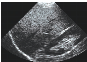
Abdominal Probe Liver, Kidney